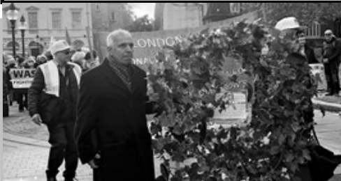
Lord Prem Sikka leads NPC demo

NPC General Secretary Jan Shortt said: "As suspected, the 'fairness' applied by the government will inevitably see the worst state pension in the industrial world become even more inadequate. Inflation has already outstripped the 3.1% offered in April 2022. The NPC demand a review of the offer and for the government to play 'fair' with pensioners and increase the state pension by the full amount of inflation."